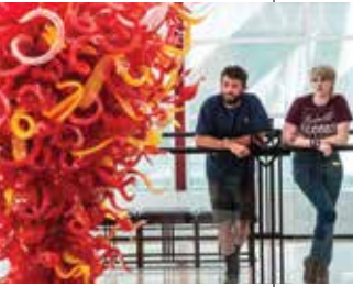
Dale Chihuly chandelier at the Columbia Museum of Art.