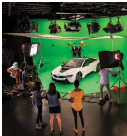
CLOCKWISE FROM TOP LEFT: Oglethorpe University; Savannah College of Art and Design; Clark Atlanta University.

grams. A unique diplomats-in-residence program exposes students to foreign service work and international career opportunities.